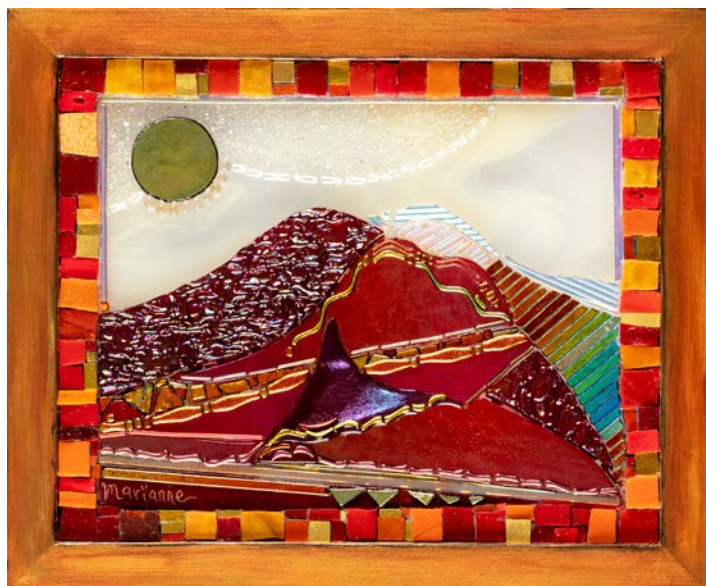
Red Canyon--The Road Less Traveled , fused glass and mosaic by Marianne Vinich from Lander, WY