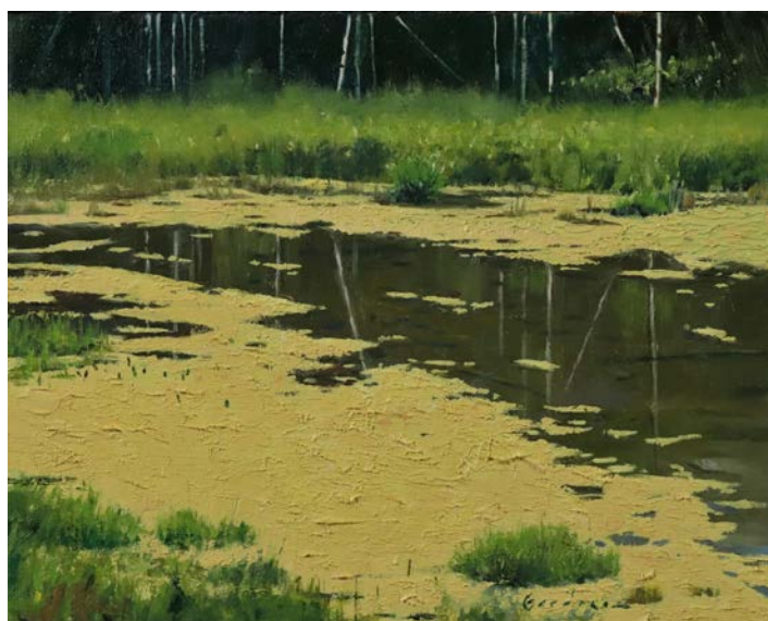
A Mountain Pond , oil by Jake Gaedtke from Bozeman, MT