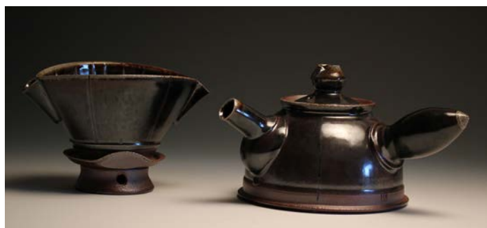
Side Handled Coffee Pot with Pour-over , soda-fired stoneware, by Rod Dugal from Sheridan, WY