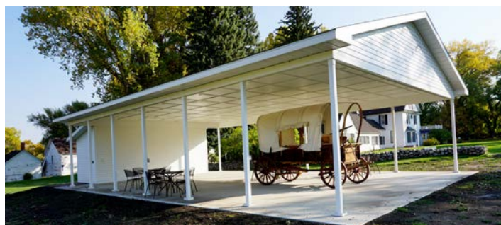
Helen Brinton Education Pavilion