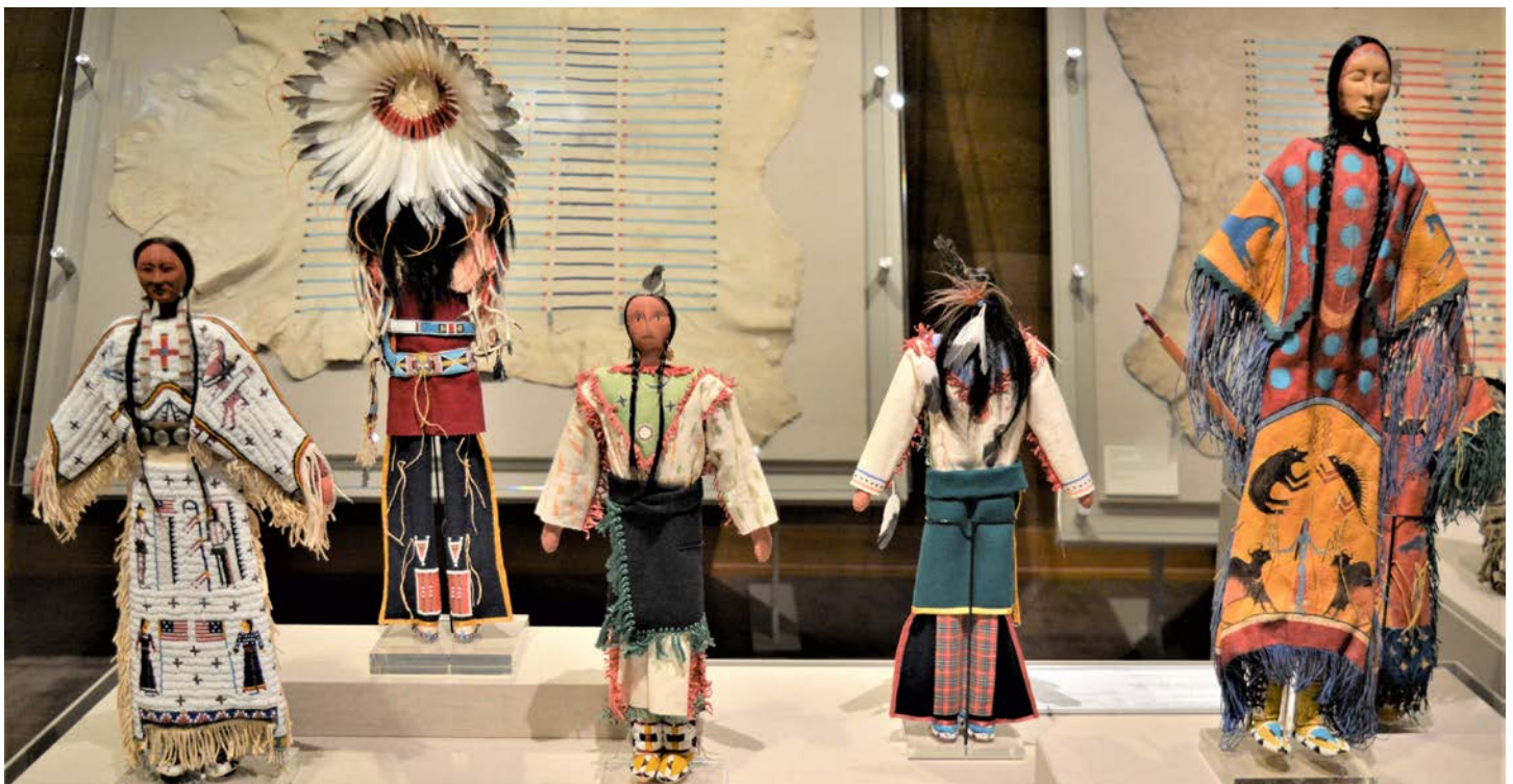
American Indian Dolls by Rhonda Holy Bear