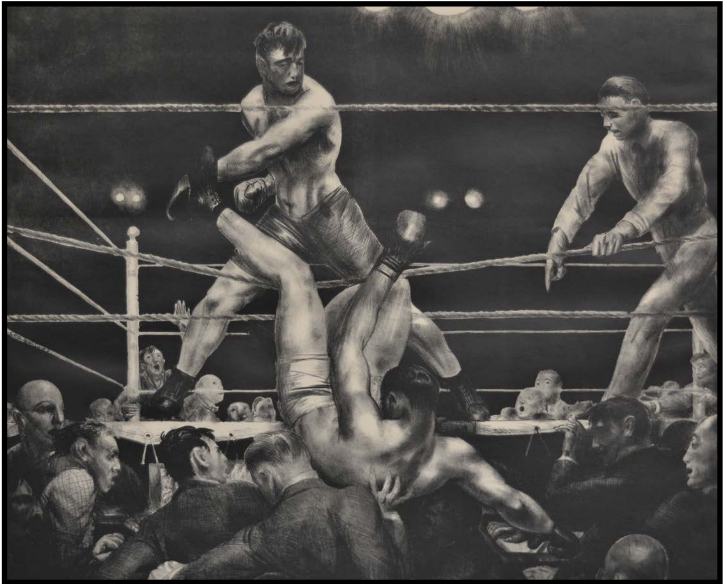
George Bellows (1882-1925), Dempsey Through the Ropes , lithograph