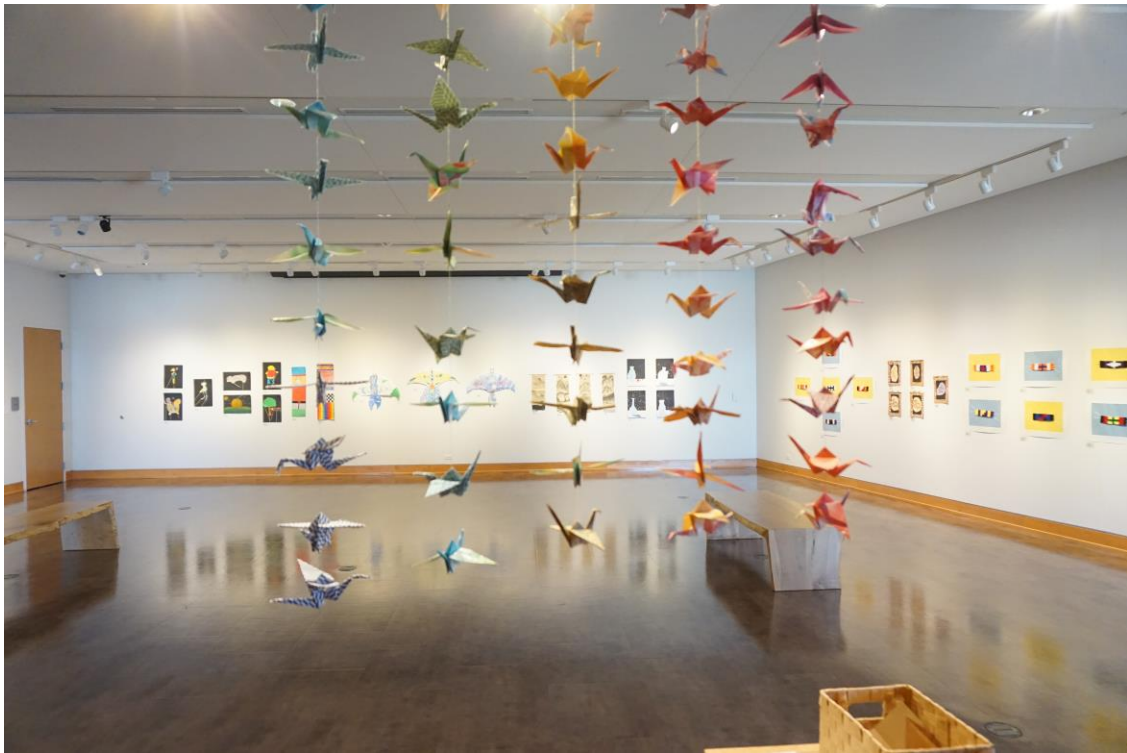
All-Schools 5 th Grade Student Art Show, 2021