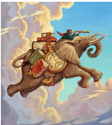
"Flying Elephant" by Greg Newbold