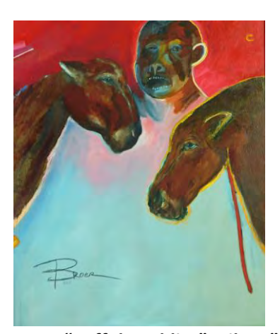
Roger Broer, "Buffalo Soldier", oil, 34" x 26"

Address: 239 Brinton Road, Big Horn, Wyoming, 82833 Mailing Address: P O Box 460, Big Horn, Wyoming, 82833