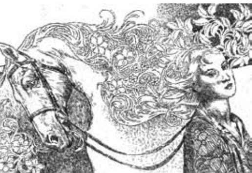
2016 Collector's Premium: Tangled , etching by James F. Jackson