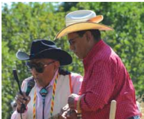
Joe Medicine Crow (on the left) at The Brinton Museum Groundbreaking Ceremony July 20, 2013

An Emeritus Member of our American Indian Advisory Council. A noted author, Crow Tribal Historian, last traditional Crow Chief, university-trained anthropologist and revered tribal elder, Joe Medicine Crow's honors and achievements are far too numerous to mention in this short paragraph. However, The Brinton Museum was quite literally blessed by its association with Joe Medicine Crow when he offered a Crow Blessing upon this institution and its director during our 2013 Groundbreaking Ceremony.