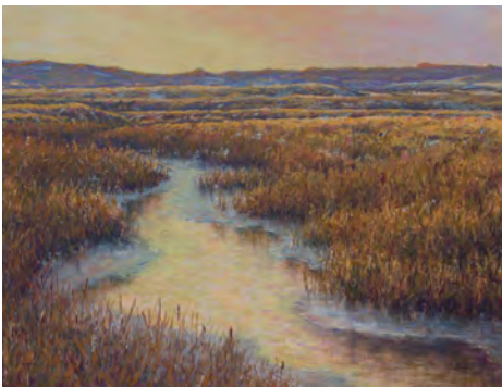
First Freeze in Campbell County , pastel by Paul Waldum

the majestic Bighorn Range as well as the picturesque Absaroka Beartooth Wilderness in Montana gathering inspiration for his landscapes. It's the beauty of the land, the quiet solitude of Western ranches in the foothills that appeals to Waldum's artistic sensibilities. The Brinton's show will encompass nearly 40 landscape works recently completed by the artist.