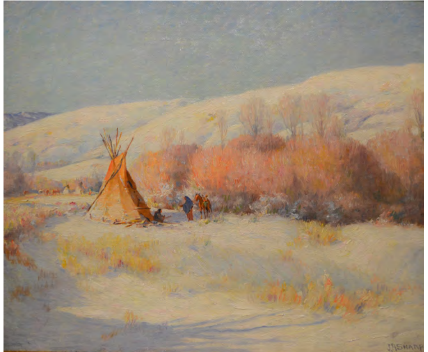
Winter Camp Bighorn Mountains ( Wood, Water and Grass ), oil by Joseph Henry Sharp

One of the real pleasures of being a curator is working in a hands-on capacity with the collection. Recently this pleasure led to an unexpected discovery which may cast a slight shadow upon museum goers' reverence for labels. In this case it references the brass label attached to the lower center of the frame on our newest gift, the marvelous Joseph Henry Sharp painting, now on display in the Ted and Katie Meredith Western Art Gallery. The painting arrived with a brass title tag reading Wood, Water and Grass , with a subtitle, Crow Indians on Custer Battlefield . Inspection of the painting's stretcher revealed that Sharp's original title was written in his own hand there for curator's eyes to see and read, Winter Camp Bighorn Mountains . This is not an isolated incident in the museum world as collectors and gallery owners often bestow titles upon paintings which may make them more pertinent to the collector as well as more appealing to a mass audience, hence I believe the inclusion of the Custer Battlefield claim. We who live 75 miles down the road from the Little Bighorn Battlefield know that the scene painted by Sharp in this oil bears little resemblance to the view one has of the Bighorns from that historic site. As curators it is our job to present the artist's title since he is the originator of the artwork and it is his interpretation of the moment.