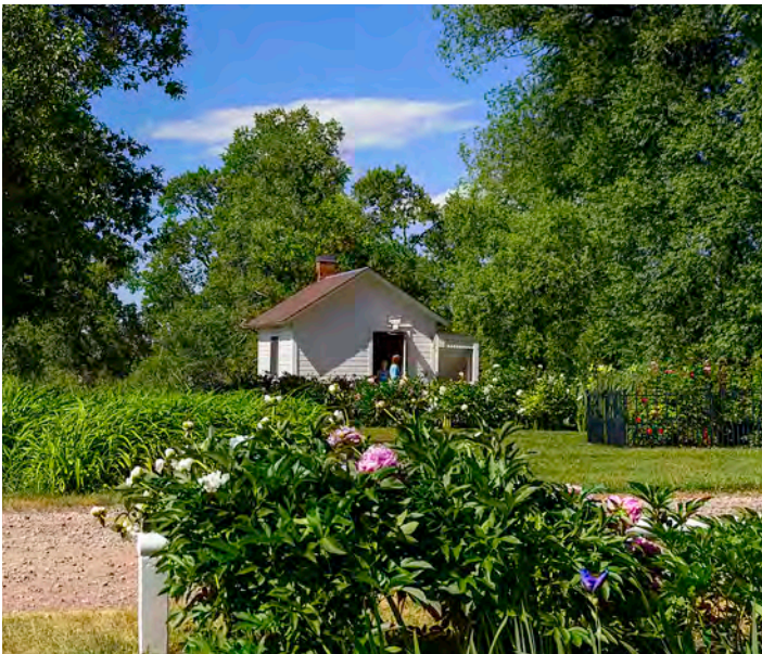
Photograph of The Brinton Milk House

The Brinton Museum's Annual Gala Dinner Dance takes place on Friday, June 29 . Cocktails, Dinner and Dancing to The Craft Brothers , Silent and Live Auction! Proceeds will benefit the Milk House restoration, an educational and historical opportunity at The Quarter Circle A Ranch. An evening of elegant food, fabulous company, great music, in an unparalleled setting awaits!