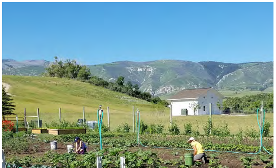
Enjoy the view while playing in the dirt at The Brinton Garden