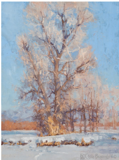
Chula Beauregard, Last One Standing , oil, 16" x 12"