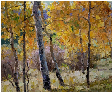
Gregory Packard, Impulse , 20" x 24"