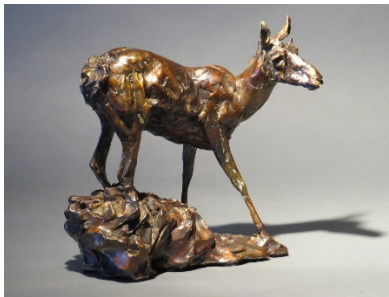
T. D. Kelsey, On Watch , bronze, 12" x 11" x 7 ½"