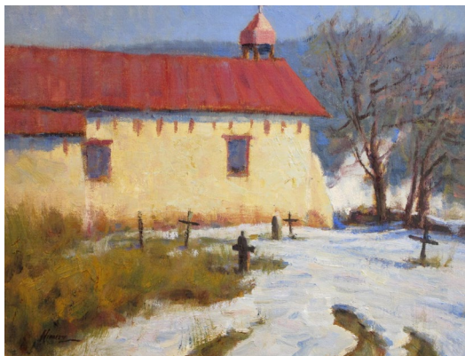
Lorenzo Chavez, Graveyard at Canoncito , oil, 17" x 16"