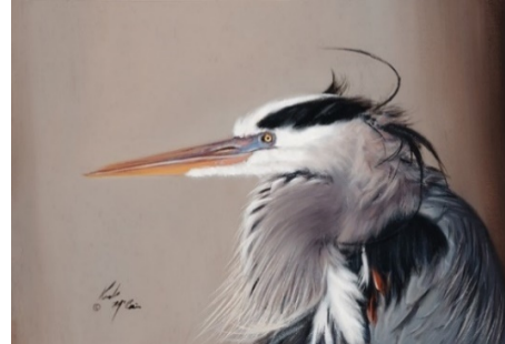
Kent McCain, Peaches with Water Drops , oil, 10" x 14" Kent McCain, Windswept , oil, 16" x 15 ¼"

The Graveyard Shift is a Brinton Museum invitational exhibition featuring works by fifteen highly-accomplished, award-winning artists from Wyoming and Colorado and also California and Wisconsin. The idea behind the show is directly related to the cemetery as a place of rest, one's last repose and the interface between life and death. Consequentially, artists were asked to submit pieces in keeping with a cemetery theme and the subject matter contained therein. Works in this show range in scale and artistic style from Loughridge's charming woodblock print of a hillside graveyard in LaSausés to Keith Davis's gelatin-silver prints of exquisite marble sculpture found in Monumental Cemetery of Staglieno, in Genoa, Italy.