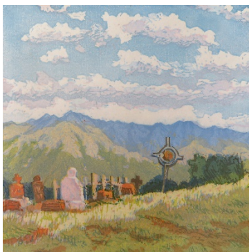
Leon Loughridge, LaSausés , woodblock print, 7.5" x 7.5"

The Graveyard Shift is a Brinton Museum invitational exhibition featuring works by fifteen highly-accomplished, award-winning artists from Wyoming and Colorado and also California and Wisconsin. The idea behind the show is directly related to the cemetery as a place of rest, one's last repose and the interface between life and death. Consequentially, artists were asked to submit pieces in keeping with a cemetery theme and the subject matter contained therein. Works in this show range in scale and artistic style from Loughridge's charming woodblock print of a hillside graveyard in LaSausés to Keith Davis's gelatin-silver prints of exquisite marble sculpture found in Monumental Cemetery of Staglieno, in Genoa, Italy.