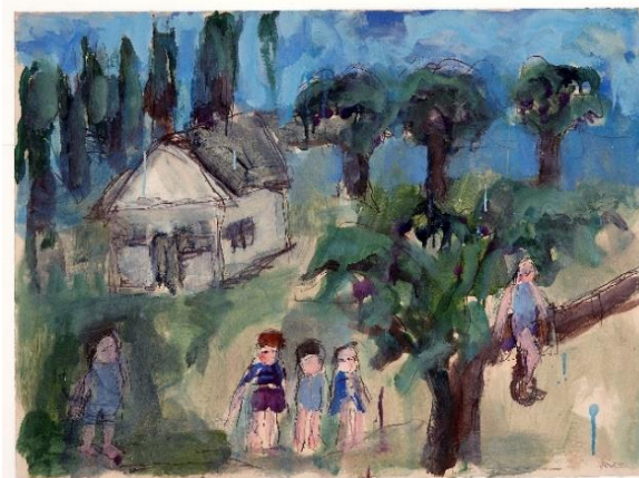
Original Illustration from "Memories of Childhood"