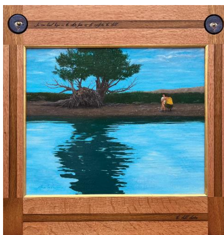
Martin Garhart, In one hand hope in the other fear as she comforts the child, the child shivers , from the series Oil Paintings , oil, 23" x 22"

The Brinton Museum in Big Horn, Wyoming presents the exhibition Seen & Said: The Art of Martin Garhart , opening in the Jacomien Mars Reception Gallery on May 11. Garhart's show represents the culmination of more than 20 years of studio work on a series of 28 paintings titled Oil Paintings and Oil Poems and a series of 19 watercolors which he calls Watercolor Poems .