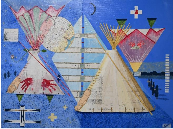
Remembered Well , antique/vintage paper and acrylic on canvas

Pease addresses the critical issues the Indian Nations are facing today. “A crisis has consumed all nations. Crime and violence has brought unexpected disappearances of our young people and death without a clue of how it happened. These young ones have felt hopeless. Suddenly they are gone. Families are left in grief, waiting for word, and looking everywhere. The spirits of those that may have been lost may find a new spiritual home. The mothers and aunts pray for their restoration and peace. In describing the imagery in the painting, Remembered Well , Pease tells us, “The Lodge and images on the left are the Other Side Camp, and the lodge and figures on the right is our world.”